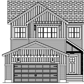
FARMHOUSE A ELEVATION