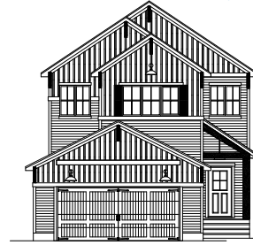
FARMHOUSE B ELEVATION